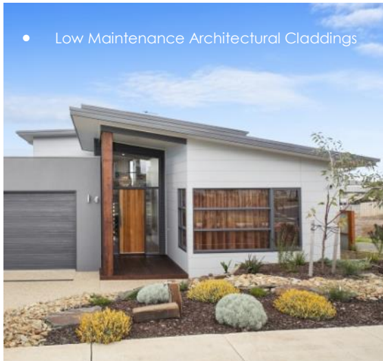
• Low Maintenance Architectural Claddings