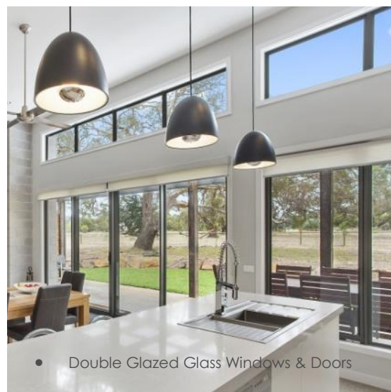
• Double Glazed Glass Windows & Doors