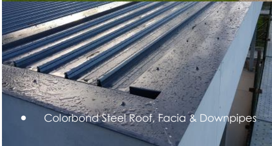
• Colorbond Steel Roof, Fascia & Downpipes