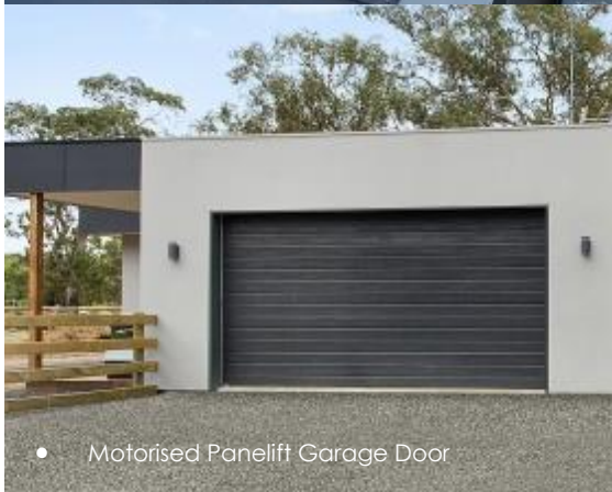
• Motorised Panelift Garage Door