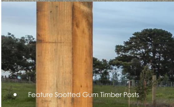
• Feature Spotted Gum Timber Posts