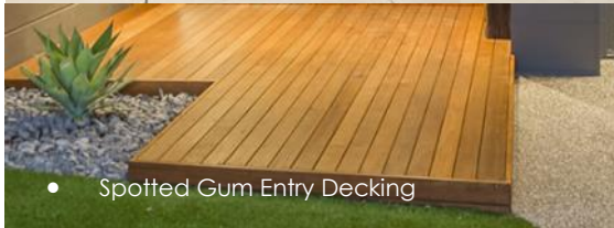
• Spotted Gum Entry Decking